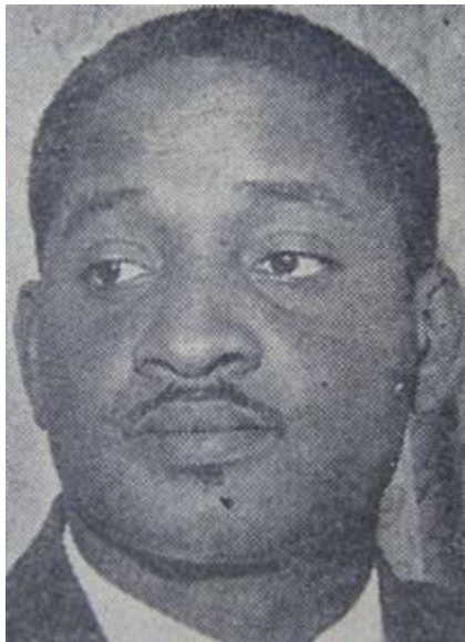
A young Forbes Burnham.

I couldn't see it at the time. Forbes and I were very close. As brother and sister, we shared many, many good times and confidences. I was not old enough to understand or appreciate what was happening in his life and character.