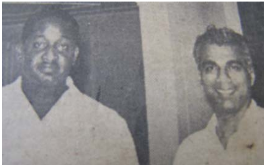
Forbes Burnham and Dr. Cheddi Jagan

Today, he runs his Party like the way King Christopher once ran Haiti. While terror is no stranger to our country, it has never been used to suppress FREEDOM, the liberty of speech, worship and the press. Would these freedoms continue under my brother? It is my concern in this area...personal individual freedom...that causes me to say to my people, to Guyana, “BEWARE, MY BROTHER, FORBES. Watch carefully to whom you hand your Government.”