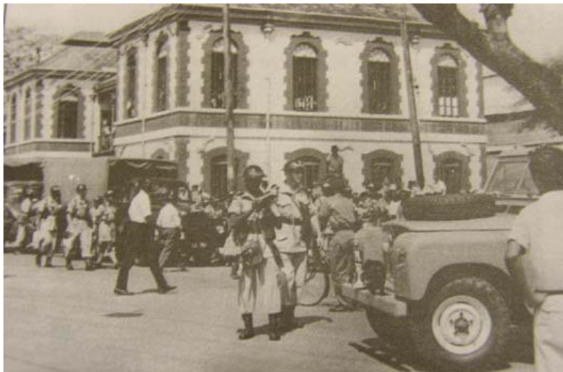
Election year in 1964; troops in the city just outside the courts and parliament buildings.